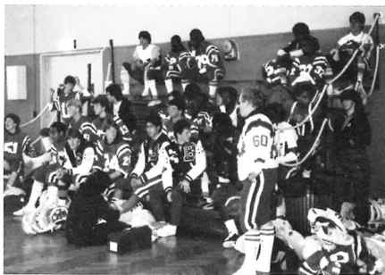
Above: The football players watch the volleyball team win while waiting to take the field on Homecoming Day. Middle right: Baron's in action against the Hanau Panthers during Homecoming 1985-86.